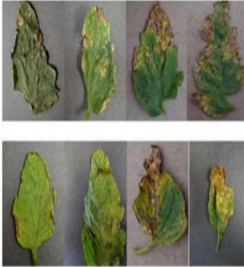
Fig 2.2: Unhealthy leaves