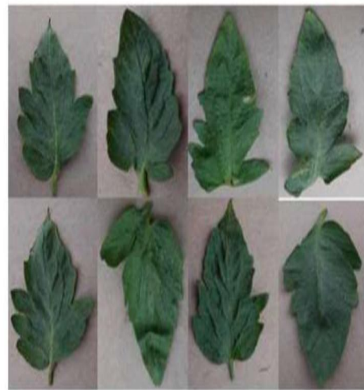
Fig.2.1: Healthy leaves

take the important data image. Using python script compared the image. It is possible that data can be repeatable (Ganesh Babu Et.al. 2020). So using some attribute like name of the leave or size of the image Data set can be erased (Parthia et.al. 2020). In the figure 2.1 sown some healthy leaves. And the other hand 2.2 figure shown diseases plant leave.